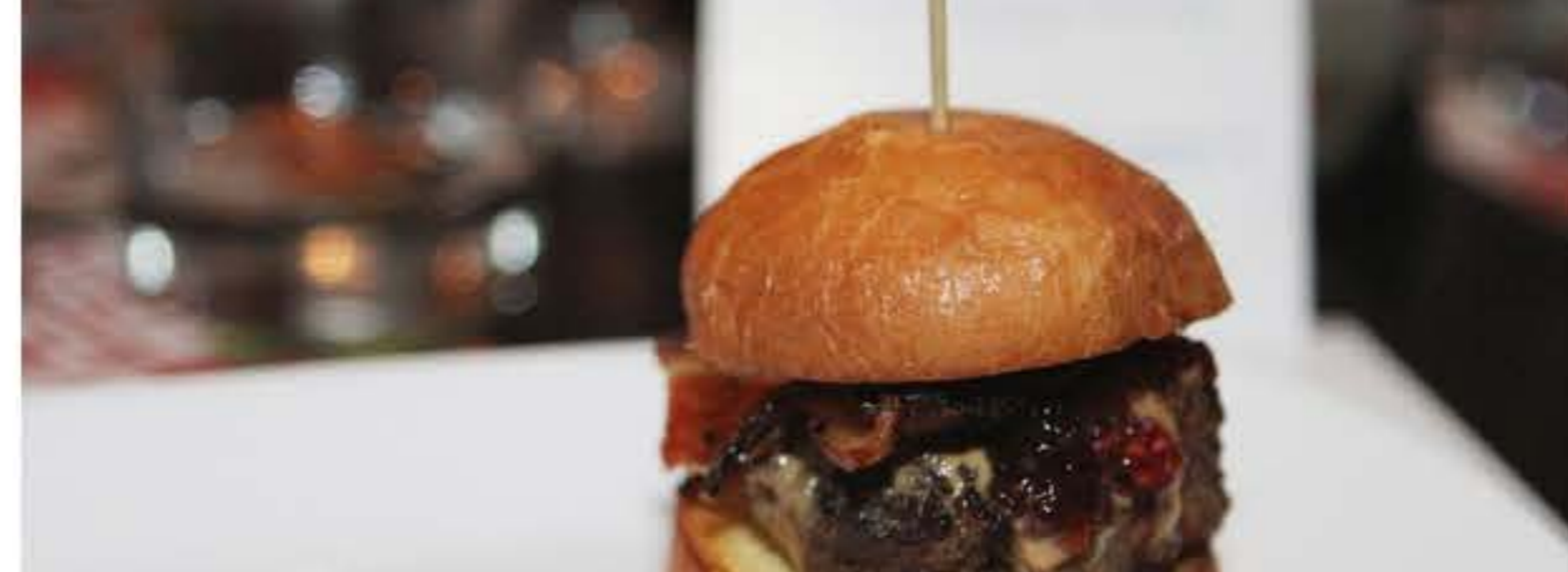
Fat Elvis Burger - (again a "slider" version of the full size burger)