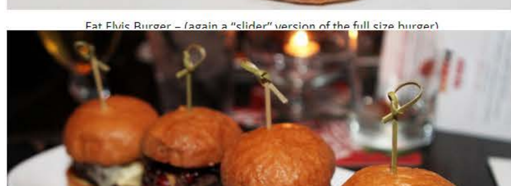
Lamb Burger, Fat Elvis, Somi Burger and Spicy Crunch