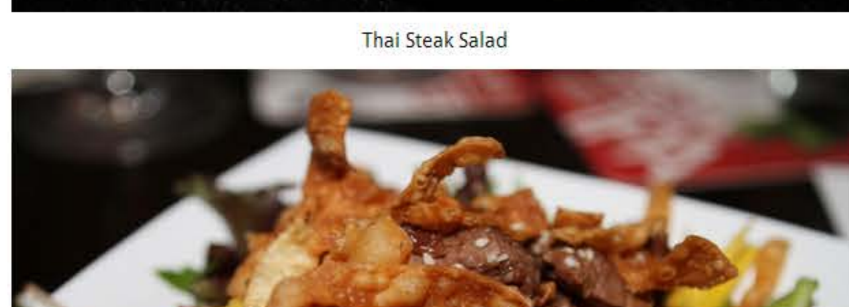
Thai Steak Salad

208 SW 2nd St Fort Lauderdale, FL 33301 (954) 525-7656