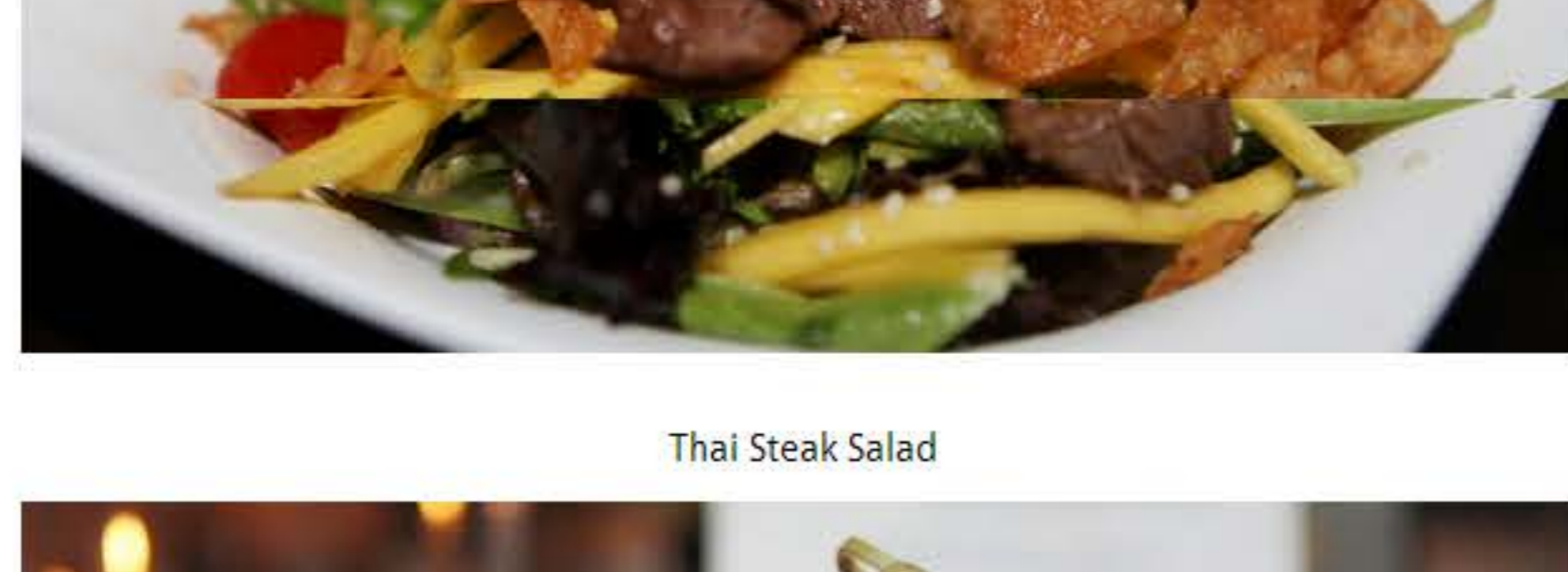
Thai Steak Salad