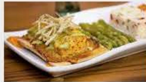
Dining scene: From Cedar-plank baked salmon to grilled octopus with squash