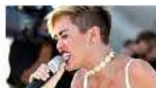
Miley Cyrus tour in Miami March 22