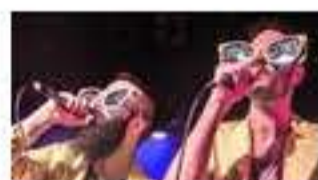
Mapping the indie-music terrain of Coastline Festival

« Previous Story More South Florida Events Go Guide Blog Next Story »