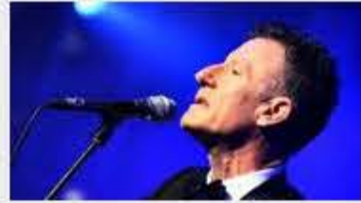
Lauderdale Live: Lyle Lovett, Indigo Girls on New River

In the tug of war between downtown's new upscale pubs, Falsetto's bid to bring a classier crowd back to Himmarshee has history on its side.