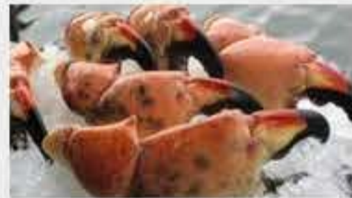
Four all-you-can-eat stone crab spots